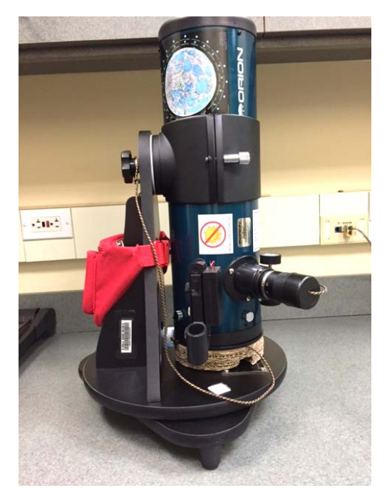
And then tighten the side clamp knob to secure it in place...